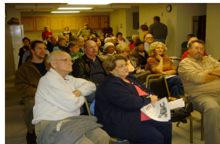
Ambridge residents expressed their pride and concern to visiting experts during the December 3 Town Hall Meeting.

Residents identified some barriers to redevelopment efforts, expressing concern about the regional perception of Ambridge, especially its reputation for crime. Council and community members challenged residents to write letters to the editor, expressing their dissatisfaction with their town's treatment in The Beaver County Times . The Council will meet with the editorial staff to encourage coverage of positive happenings in the town. Attendees also noted that the failure of some property owners to keep their land and storefronts clean hurts Ambridge's image. A volunteer neighborhood group informed the meeting that they picked up 59 bags of trash from around Foodland, which attendees overwhelmingly agreed is in distressing condition.